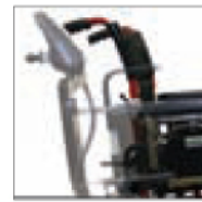
Flip-Up Arm Rest