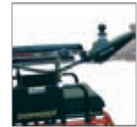
Adjustable Length VSI Controller