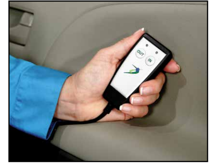
Easy one button operation hand-held pendant