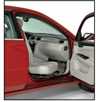
At the touch of a button, the seat power rotates to provide easy access to the seat.