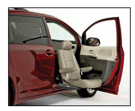
Available in a broad range of colors, in two upholstery options - Ultraleather<sup>TM</sup> Plus and Metro Tech fabric.