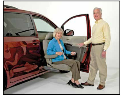
Assists in entering and exiting your higher vehicle.