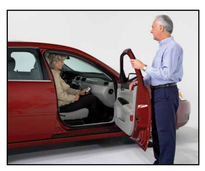
Caregivers marvel at how the Valet LV rotates the seat over the door sill, bridging the gap for an easier transfer.