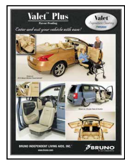
For more information on this seat please refer to the Valet Plus brochure!