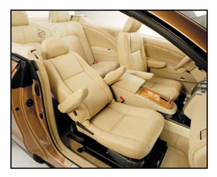
Full recline with levers on both sides