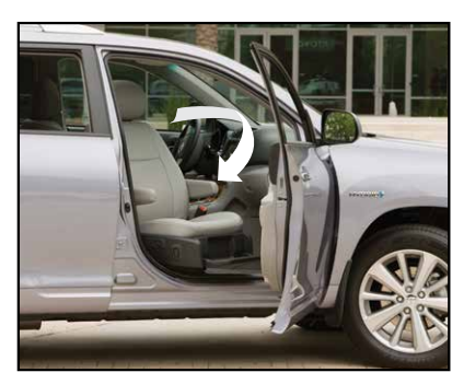
The seat rotates...