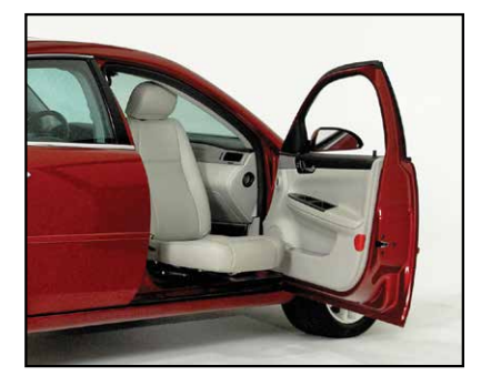
The Valet LV can handle a user weight up to 330 lbs (159 kg).