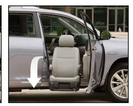
...as it comes out of the vehicle and lowers to the desires height!