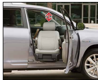
...then automatically reclines to provide head clearance...