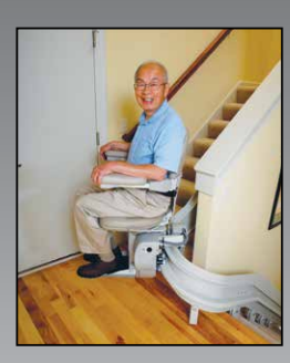
CUSTOM CURVED RAIL STAIRLIFT