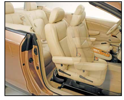
Power forward/backward seat adjustment