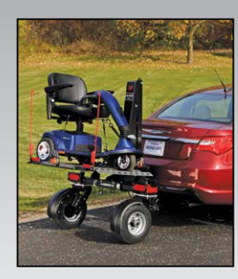
CHARIOT™ VEHICLE LIFT